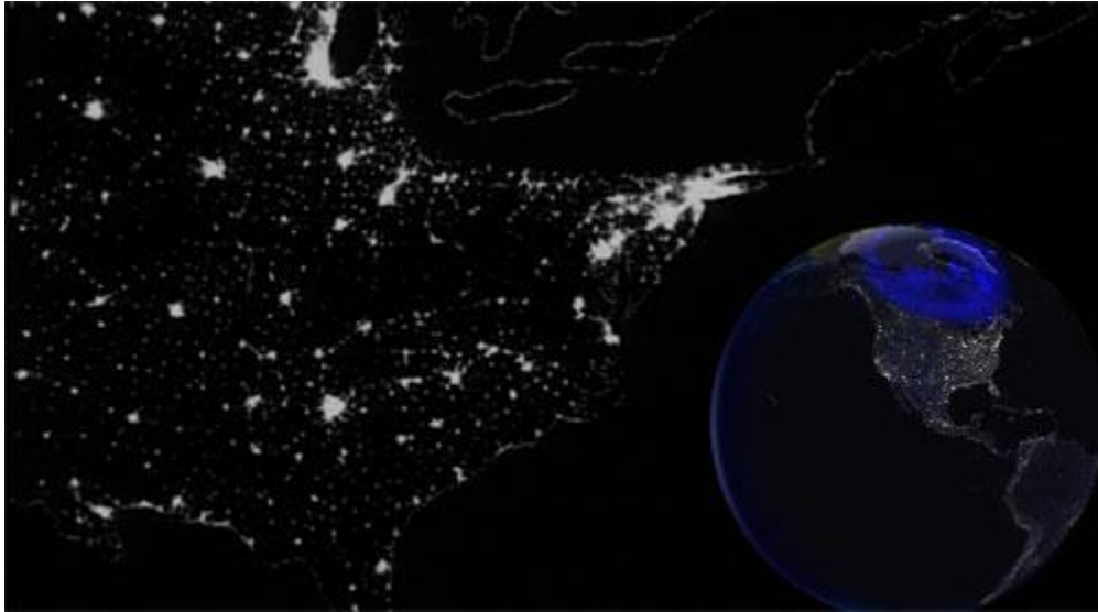
Artist rendition of the 1989 blackout.

On March 13, 1989 the entire province of Quebec, Canada suffered an electrical power blackout. Hundreds of blackouts occur in some part of North America every year. The Quebec Blackout was different, because this one was caused by a solar storm!